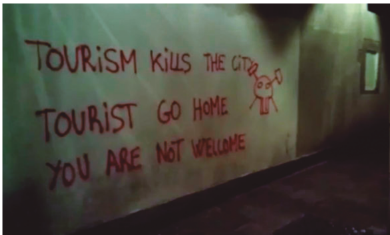
Photo 1. A Graffiti in Barcelona