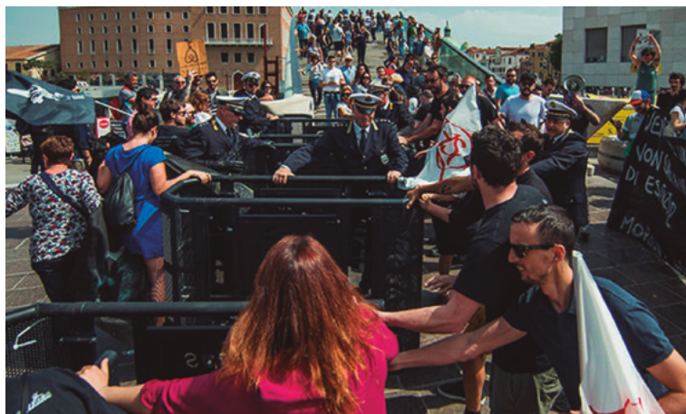
Photo 2. Response to Turnstiles in Venice